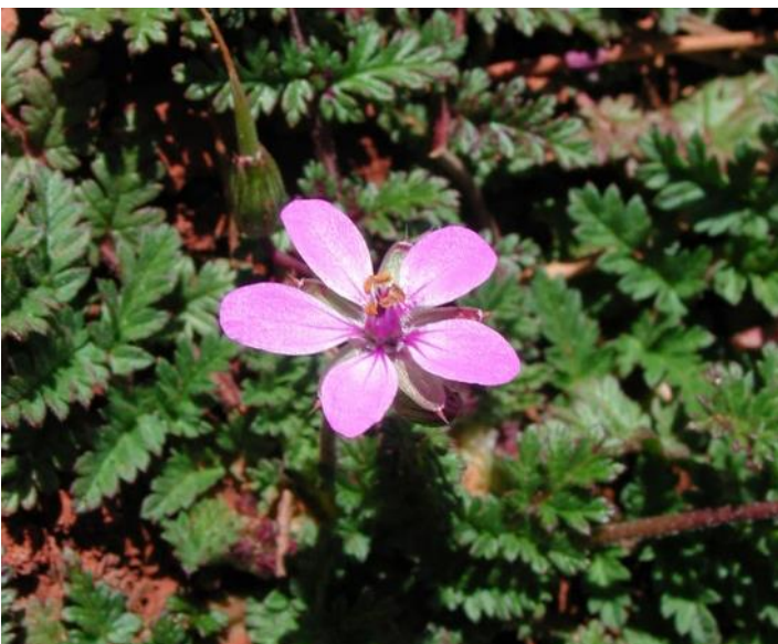
Filaree flower.