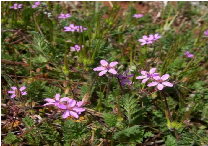
Filaree habit.