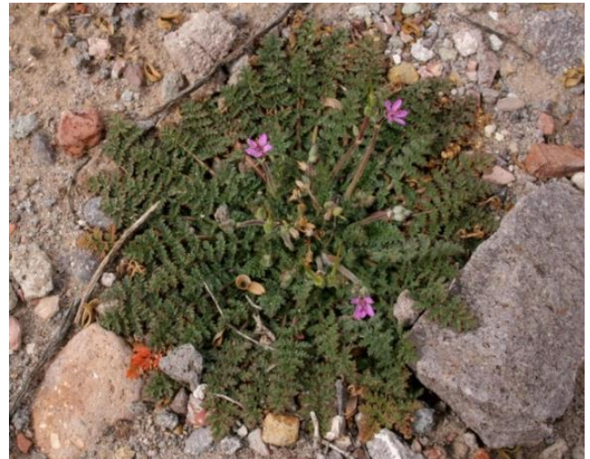
Filaree habit.

Botanical description: Low-growing and spreading herbaceous plant with a strong, pungent smell.