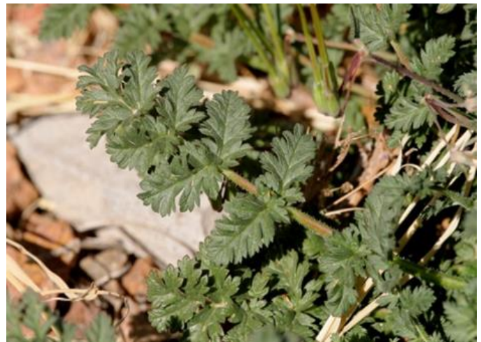
Filaree dissected leaf.